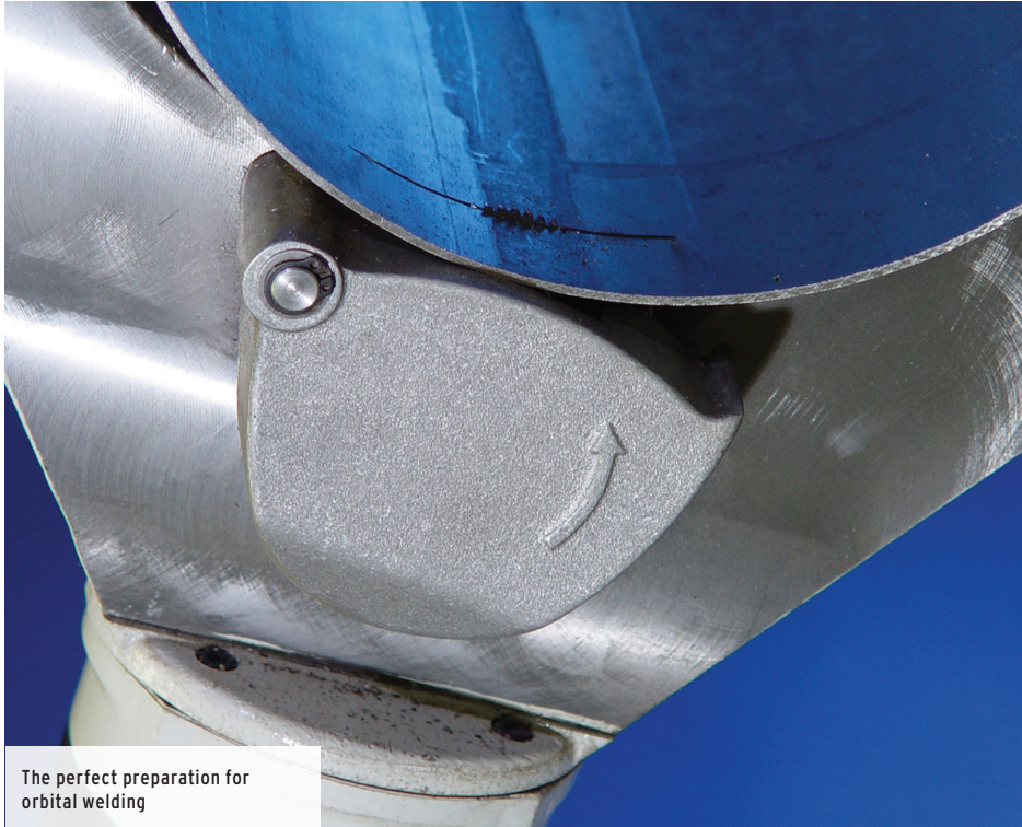
The perfect preparation for orbital welding

Cutting and beveling high-alloy steel (stainless steel), low- and unalloyed steel, plastics, casting materials and non-ferrous metals in just seconds, using the "Planetary Cutting" method.