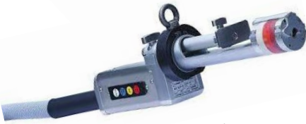
HX12P / 25P